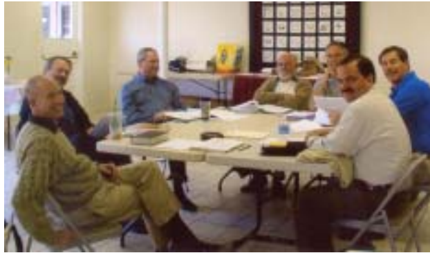
IBCD Board Members at the April 2006 meeting.

I believe that this will result in the continued increase of IBCD's effectiveness. You have been loving and faithful partners with us in this small but important ministry. You have been a gift from God to us. Please continue your generous support of IBCD. May HE who ALONE IS ALWAYS FAITHFUL bless you and enable you to remain faithful to IBCD. And to Him alone be the glory. Amen.